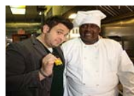
Harlem Man v. Travel Channel