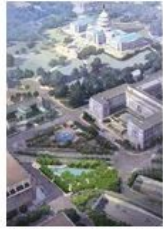
Drawing of the American Veterans Disabled for Life Memorial from the memorial foundation's...

One thing has been carved in stone — literally — when it comes to Washington landmarks: National memorials are for the dead.